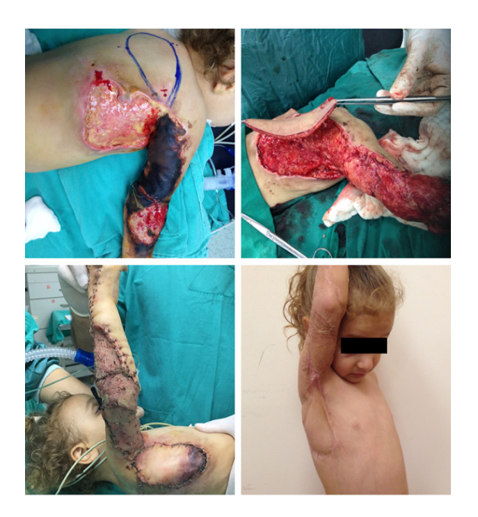
Figure 5. Presentation of Case 5. Above Left: Severe burn injury on the arm and lateral torso. Above Right: Extensive debridement and elevation of the flap. Skeletonizing the pedicle could be harder in pediatric patients. Below Left: Forearm and arm defects were grafted. Axilla and lateral torso is covered with scapular flap. Below Right: Axillary and arm range of motion is acceptable. Nipple-areolar complex is on the midline.

width. Donor site scars widened between 3 months to 6 months post-operatively and independent of patient age. Donor site scars ranged from 1.5-2.6 cm. Figure numbers 3 and 4 demonstrate hidradenitis suppurativa and burn contracture treatments with scapular island flaps respectively. Keloids were not observed.