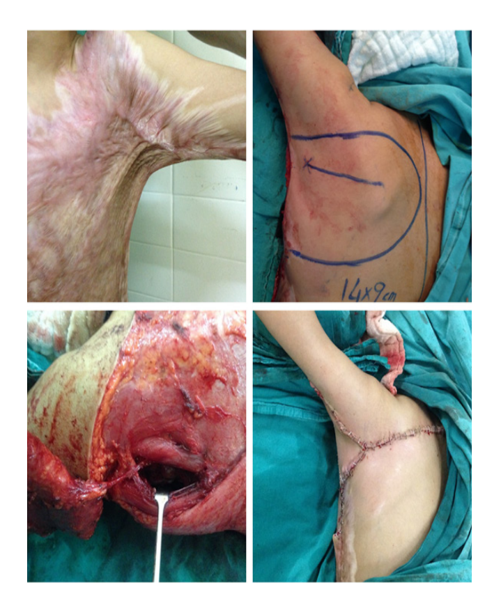
Figure 1. Technique of scapular flap elevation. Above Left: Axillary contracture extending to the arm and posterior axillary line. Above Right: Planning of the scapular flap in a prone position. Below Left: Skeletonizing the pedicle and dissection of the triangular space. Below Right: Coverage of the defect without any tension

Scapular flap is one of the reconstructive options in axillary defect coverage. The horizontal branch of circumflex scapular artery is the nutrient vessel of the flap. Scapular flap could be executed as a local flap(6) or a free flap(7) or even as a pre-expanded flap(8) according to the requirements. It is best known with the thin and pliable skin that is an ideal structure for the axilla. However, there is no straightforward answer to which flap is the ideal choice of axillary coverage. This study is aiming to present reconstruction of axillary defects with scapular island flaps for different indications and to discuss the outcomes of the donor sites so as to suggest it as a workhorse flap in axillary