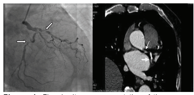
Figure 1. The simultaneous presentation of the coronary lesions on LAD and Cx with conventional CAG and 128-slice MSCT coronary angiography (On the image of conventional CAG, two critical lesions are shown (Left side) on LAD (oblique arrow) and CX (horizontal arrow). Same lesions are presented by MDCT (right side))

Computed tomography coronary angiography was performed with a 128-slice multi-detector CT scanner (SOMATOM Definition AS, Siemens Medical Solutions, Forchheim, Germany). ECG-controlled tube current modulation technique and prospective ECG-gating were used for all examinations. Scanning protocol was as follows: tube voltage 120 kV, tube current 150-300 mAs/rotation, gantry rotation time 300 msec, collimation (128x0.6 mm slice). All images were acquired during full inspiration and breath-holding. A beta-blocker (metoprolol, 5 mg, IV) was injected intravenously if the heart rate exceeded 70 bpm prior to the examination (n=18; 42%). In five cases without sufficient decrease in HR, metoprolol dose was not repeated, but a target heart rate of ≤80 bpm was reached in every patient. Mean HR was 69±4 bpm (min-max: 54-78). A 70-80 ml of non-ionic contrast medium (lopromide, Ultravist 370 mg l/mL, Bayer-Schering Pharma, Berlin, Germany) was injected into an antecubital vein at a rate of 5 ml/sec using a double-headed auto-injector (Covidien OptiVantage™ DH; Mallinckrodt, Cincinnati,