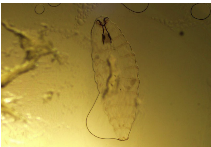
Figure 1. The first stage of Oestrus ovis larva

Several species of flies belonging the order diptera have been identified to cause myiasis in vertebrate animals and humans. Of these, Oestrus ovis (sheep nasal bot fly) is one of the most common agents reported to cause human myiasis (2). Sheep and goats are the normal hosts for the Oestrus ovis larvae. Adult female flies deposits their larvae near the nostrils of these animals. Larvae enter the nasal cavity or sinuses of the sheep where they mature in three stages, then leave the animals and enter into the pupal stage to complete their development as mature flies (6). Humans are accidental hosts and infestations of various regions of the body, skin and ocular surface being the most common, have been described (1). Usually first stage larvae are reported in myiasis of humans (7). We also observed first stage larvae in our case.