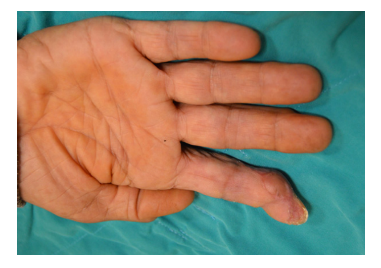
Figure 3d. Partial necrosis and secondary healing following debridement

smokeless tobacco agent including 'Nicotiana Rustica Linn'. In the case with partial necrosis, it is estimated that use of immunosuppressants due to rheumatoid arthritis and the radially deviated ankylosis of the distal interphalangeal joint of the patients finger could have further caused a constant postoperative tension and ischemia of the distal portion of the flap. According to our particular practice, if DAPF is planned to be harvested from proximal phalangeal