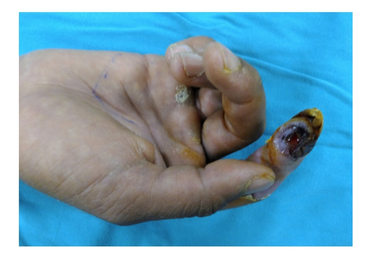
Figure 6a. Index finger soft tissue defect caused by infection

radially dominant in 4th and 5th finger. Nevertheless, variations are not uncommon. Few authors suggest identification and confirmation of perforators of proper digital artery, whether on proximal or middle phalanges, by a handheld Doppler USG prior to flap harvest while most authors advocate that perforator localizations are such constant that DAPF can be raised as a free-style fashion (1,6,7,14). In accordance with this, Braga-Silva et al. have demonstrated on fresh human cadavers that digital artery perforators arise at constant locations in the proximal and middle phalanges at a fixed distance from known landmarks