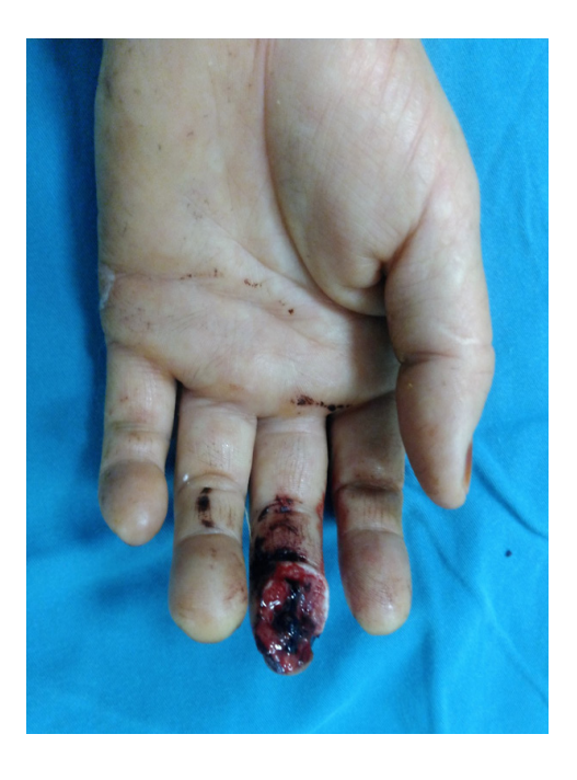
Figure 2a. Volar defect of the middle finger

whereas pedicled interpolation flaps or free flaps harvested from the groin-abdominal region may be required in order to cover larger sized defects (8,9). However, interpolated flap techniques require twostage surgery and may cause stiffness in the joints due to immobilization of the fingers and restriction in range of motion of the fingers. Satisfactory outcomes with good contour and sensory restorations have been reported in the literature using free flaps such as free venous flap, free hemipulp, free thenar flap and free perforator flap of the superficial branch of the radial artery; however advanced microsurgical experience is a must for a fingertip or pulp defect reconstruction using these microsurgical options and duration of operations are quite long compared to conventional ones (10,11). Moreover, these techniques often carry a risk of anastomosis problems, vascular spasm, increased thrombosis rates and high flap loss risk depending on all these factors. Reverseflow homodigital island flaps are also good flaps of choice and can be used in fingertip and pulp defects reconstruction, but a reverse-flow homodigital flap dissection is more invasive, extensive, time consuming and it causes cold intolerance since this technique necessitates the sacrifice of proper digital artery of the finger.