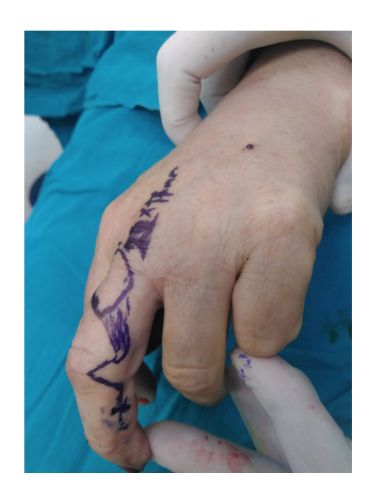
Figure 2b. Flap design

DAPF is a versatile flap that can be easily harvested from the same finger without sacrificing