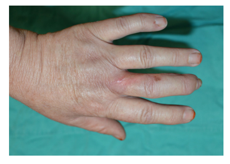
Figure 5b. Donor site morbidity is minimal and the scar is acceptable on long term follow up. Brownish skin lesion on dorsal middle finger is a new burn

preserve joint movements and prevent any possible contractures. Three-dimensional considerations, orientation and direction of the pulp / fingertip defects should also be considered for surgical decision. DAPF reconstruction seems more suitable for obliquely oriented wounds. That is to say, ulnar sided DAPF harvest and inset seems more physiological for the 2nd and 3rd fingertip defects extending obliquely from proximal-ulnar to distal-radial manner, whereas radial sided DAPF is more physiological for 4th and 5th fingertip defects extending obliquely from proximalradial to distal-ulnar manner since digital artery is often ulnarly dominant in the 2nd and 3rd finger and