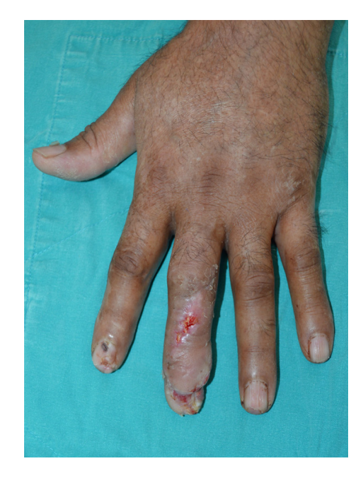
Figure 4b. Postoperative 3 week result is seen