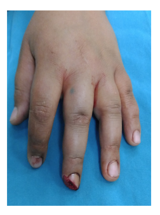
Figure 1a. Oblique distal fingertip defect on middle finger

Principles of fingertip reconstruction are preserving finger function and length as well as maintaining cosmesis and covering the defect with durable, sensitive and glabrous skin. There are various commonly performed local flaps options for reconstruction of small sized finger tip defects, such as V-Y advancement flaps, reverse adipofasial flaps, dorsal metacarpal artery flap, cross finger flap, thenar flap, neurovascular island flaps and reverse-flow homodigital artery flaps, reverse dorsal vein flaps