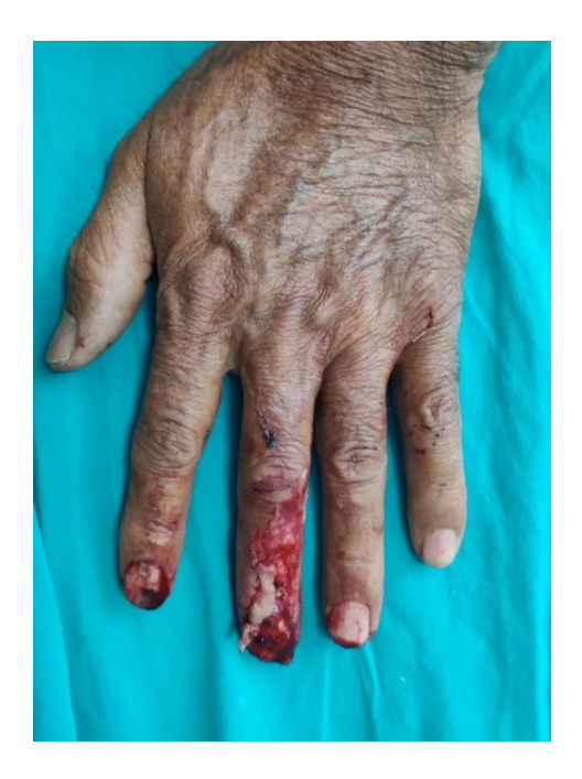
Figure 4a. Fingertip and nailbed defect on middle finger

area and used as a propeller flap, skeletonizing the perforator should be avoided because the perforator branches very small calibered and delicate. Therefore, without sufficient soft tissue envelope, vasospasm and/or thrombosis is more likely to occur and impair the flap circulation in a proximally harvested flap. Another important technical issue is that after DAPF harvest, pedicle should be transferred over the radial or ulnar side of the proximal interphalangeal joint to