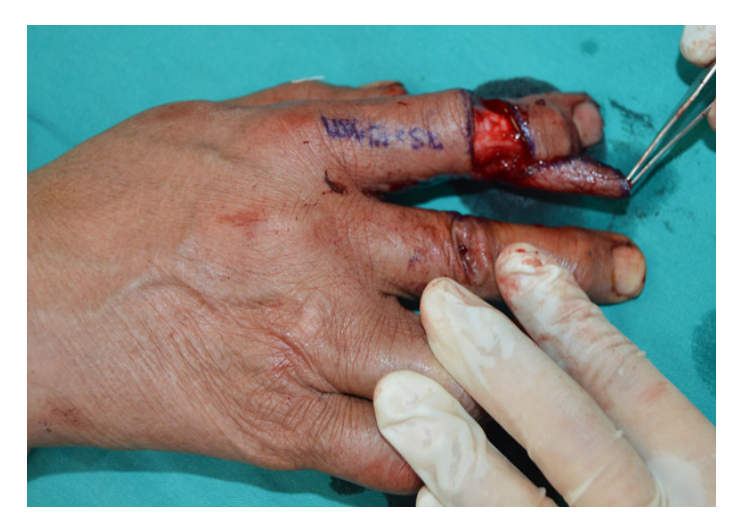
Figure 3b. Flap is raised and rotated