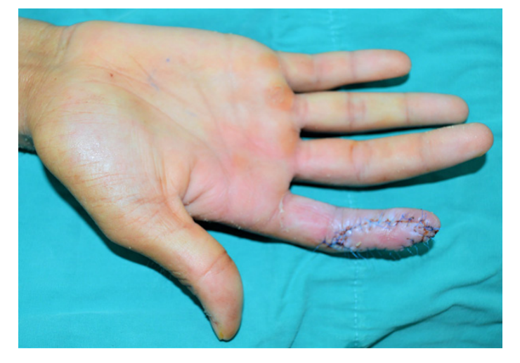
Figure 6b. Postoperative first week photo of reconstruction by DAPF used as an advancement flap