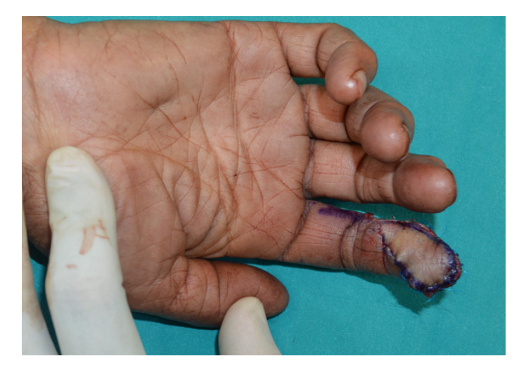
Figure 3c. Final inset of the flap. Note the distal interphalangeal joint is radially deviated