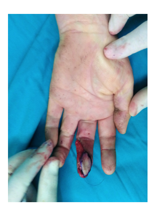
Figure 2d. Flap is rotated 180° as propeller and inset to the pulp defect

stage surgery. However, the main disadvantages are the high risk of venous congestion in the early period, the tiny caliber of the perforator, the risk of kinking, twisting or compression when rotated as propeller. Nonetheless, DAPF is not only quite susceptible to the patient's metabolic status (dehydration, hypotension, etc.), medications, smoking habitus and/or similar substance abuse but also contraindicated in patients who have vasospastic disorders like Raynaud,