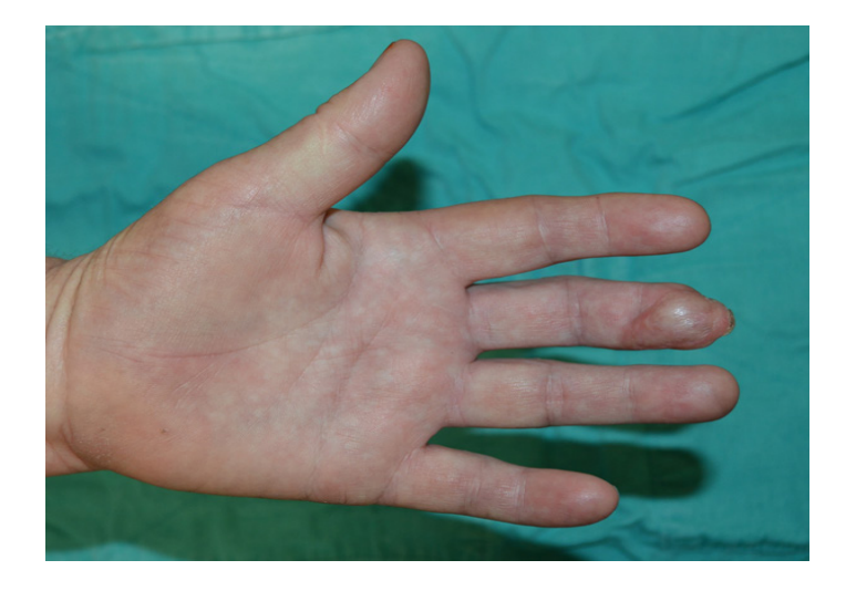
Figure 5a. Satisfactory result on postoperative 4 months (Case 3)

Digital Artery Perforator Flap Use in Finger Defects