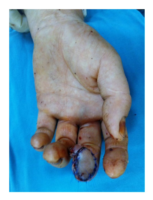
Figure 2e. Immediate postoperative view of the flap is seen. Flap pedicle is not tunneled but rather skin grafted to avoid any compression

stage surgery. However, the main disadvantages are the high risk of venous congestion in the early period, the tiny caliber of the perforator, the risk of kinking, twisting or compression when rotated as propeller. Nonetheless, DAPF is not only quite susceptible to the patient's metabolic status (dehydration, hypotension, etc.), medications, smoking habitus and/or similar substance abuse but also contraindicated in patients who have vasospastic disorders like Raynaud,