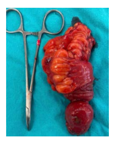
Figure 2. Ileoileal intussusception resection material

abdominal pain, nausea and vomiting. In addition, she had constipation for 2 days. Her history was unremarkable except for mental retardation. On physical examination, there was distention and tenderness in the abdomen. Leukocytosis and CRP elevation were present. CT scan was done due to air-fluid levels in plain abdominal x-ray. Computed tomography showed an appearance compatible with intussusception at the level of the distal ileal loops and dilatation in the proximal intestinal loops. Urgent exploration decision was made. In the exploration,