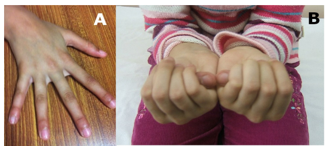
Figure 2. A) Arachnodactyly and B) Thumb sign of the proposita